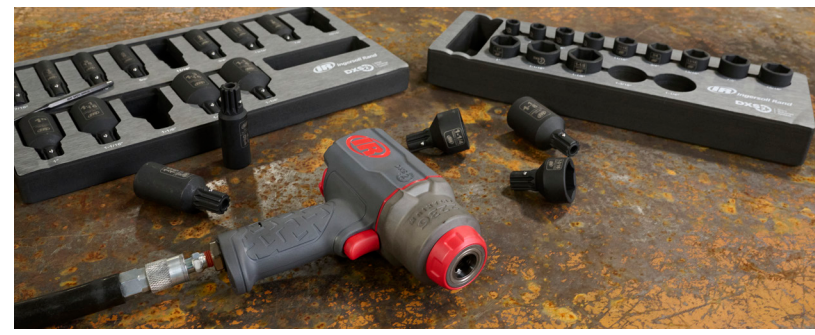
DXSK2H14L - DXS2™ Drive Hex Deep SAE (Imperial) Impact Socket Set, 14-Piece