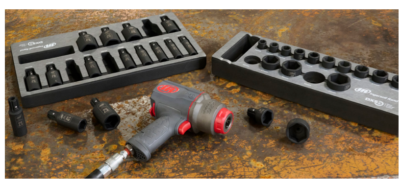
DXSK2M15L - DXS2™ Drive Deep Metric Impact Socket Set, 15-Piece